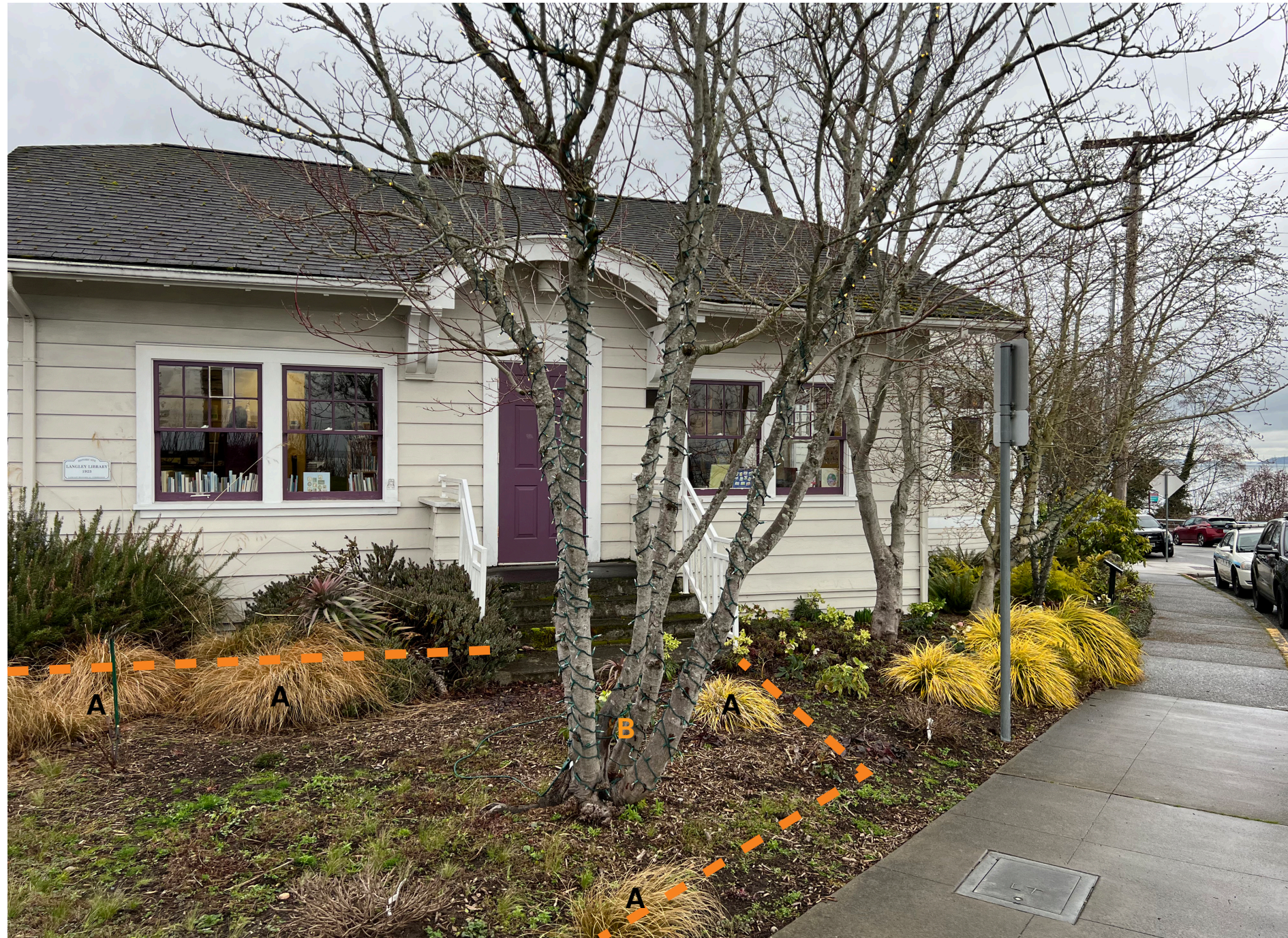
Photo of existing outdoor area