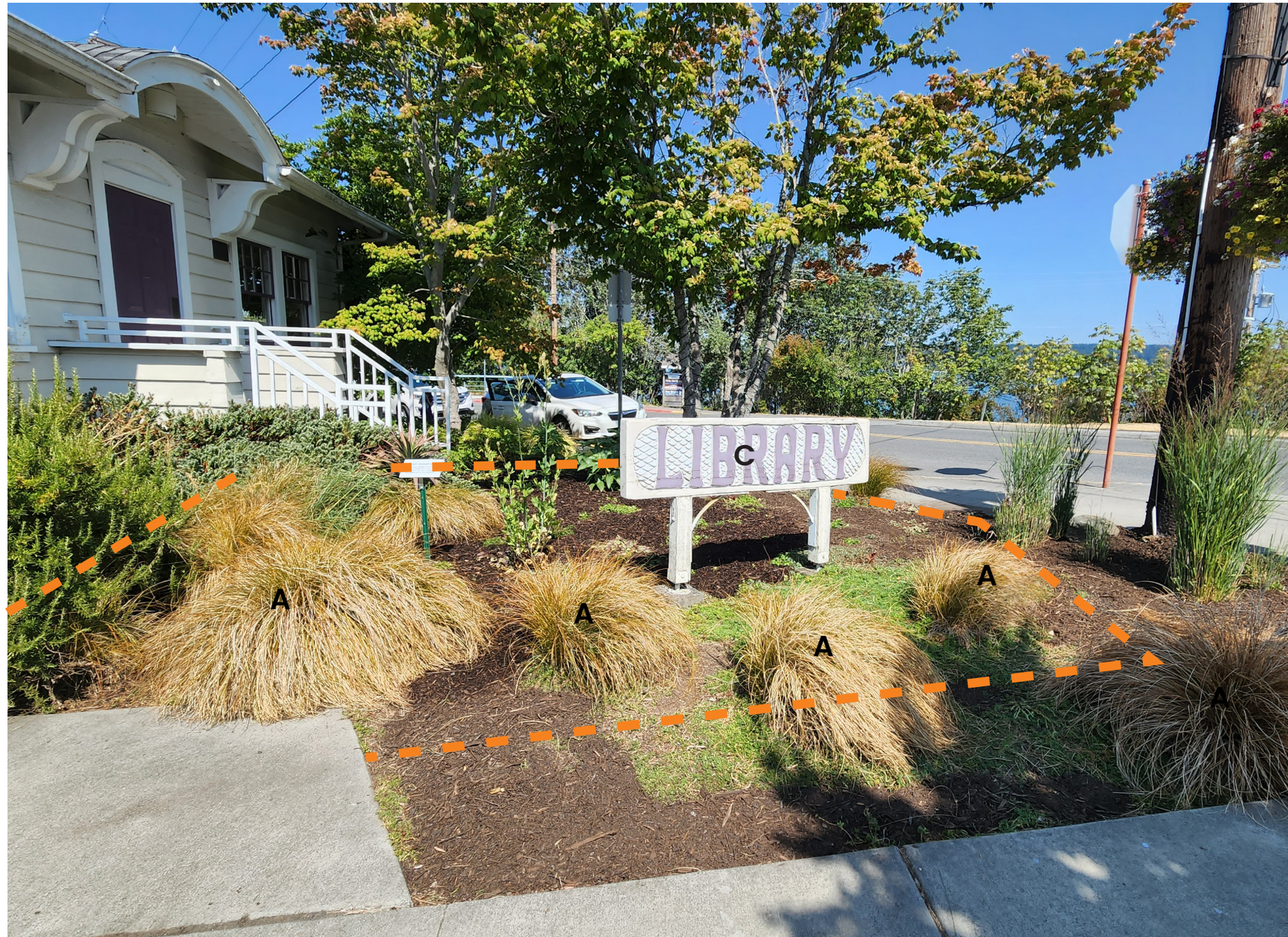
Photo of existing outdoor area