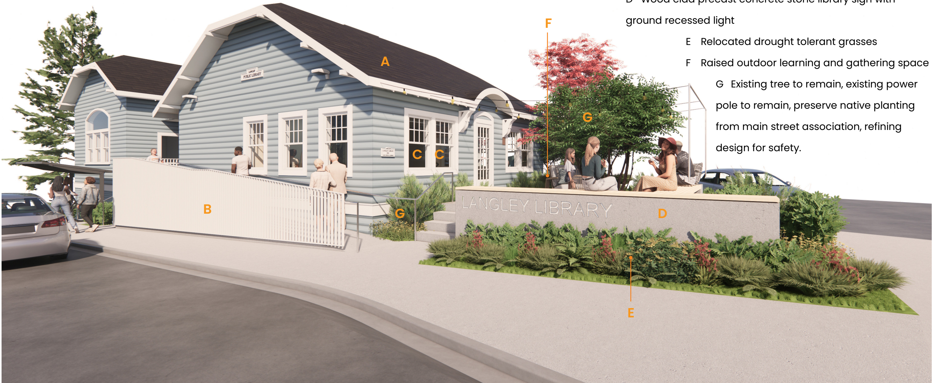
Rendering Langley Public Library, view from South East.