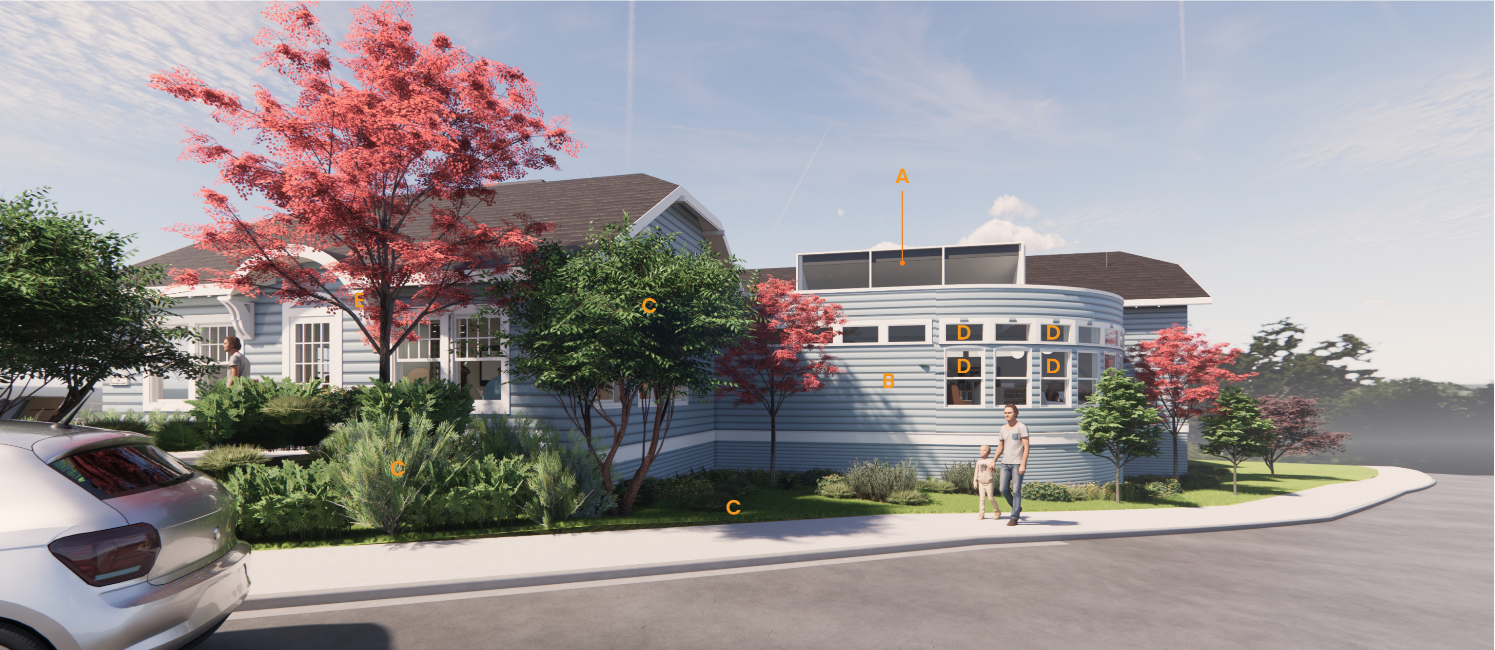
Rendering Langley Public Library, view from First Street