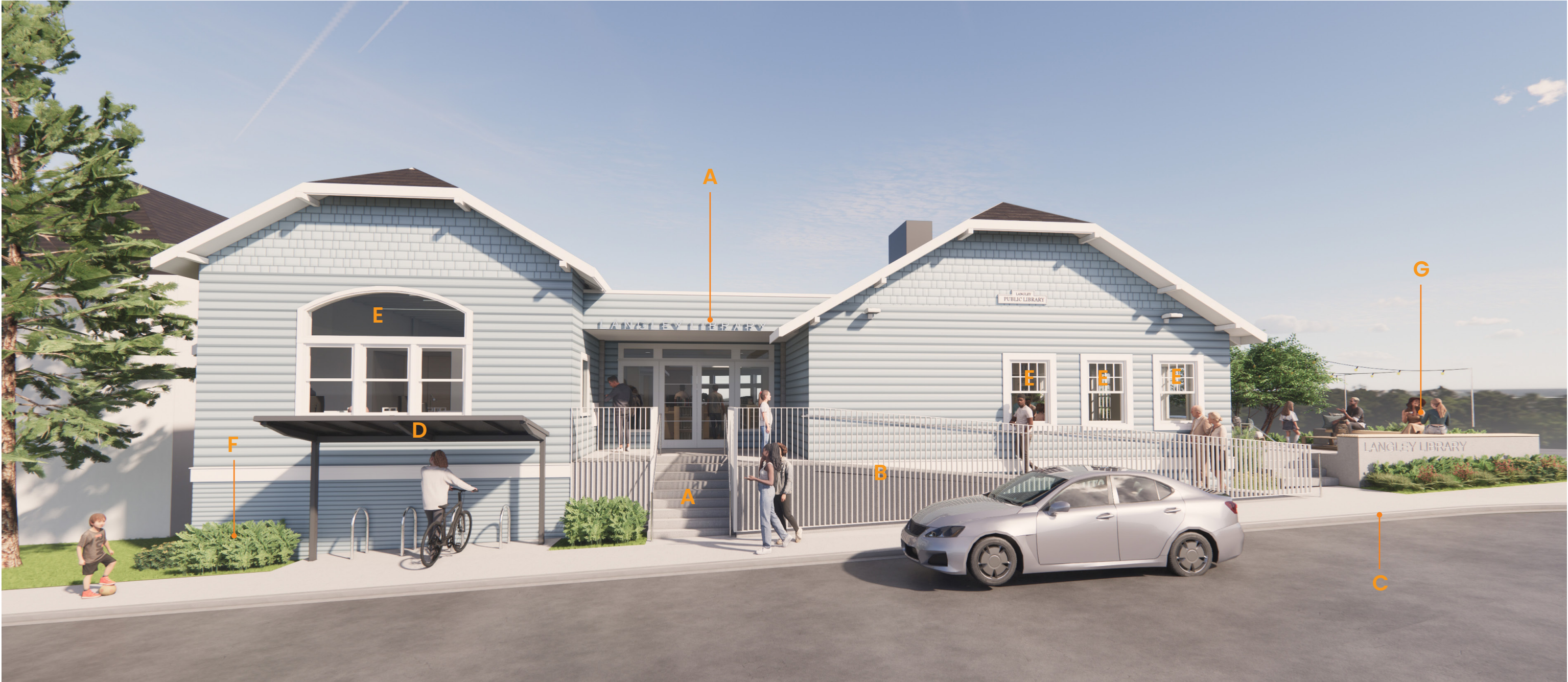
Rendering Langley Public Library, view from 2nd Street