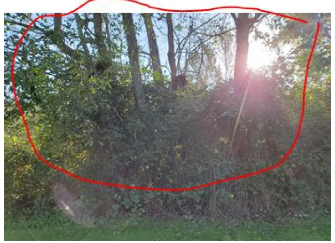
The extreme left and right of this cluster of (6) trees are marked with grey spray paint. The (4) in the middle with bases covered by blackberry brambles yield the (10) in scope.