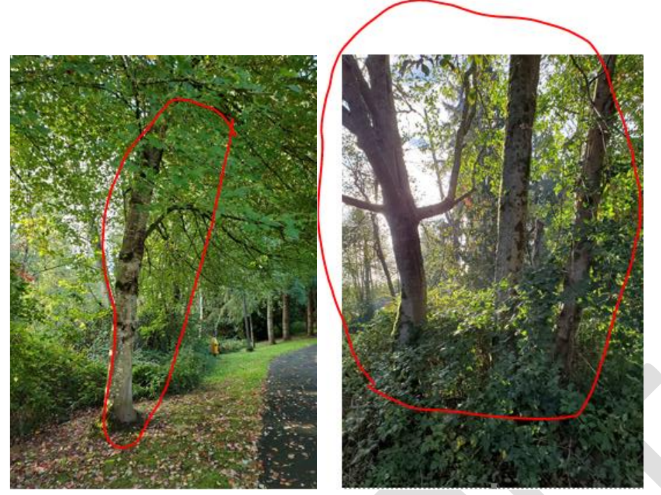
The above (4) are marked with grey spray paint and near each other.