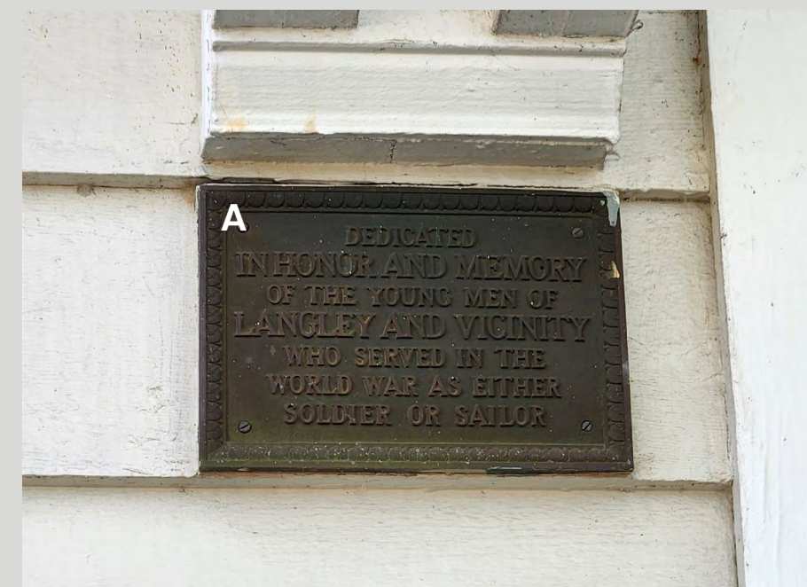
2022 Dedication plaque at right of door