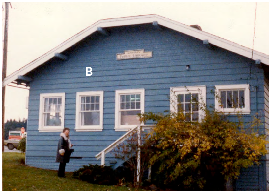
ca. 1980 Langley Public Library, view from East.