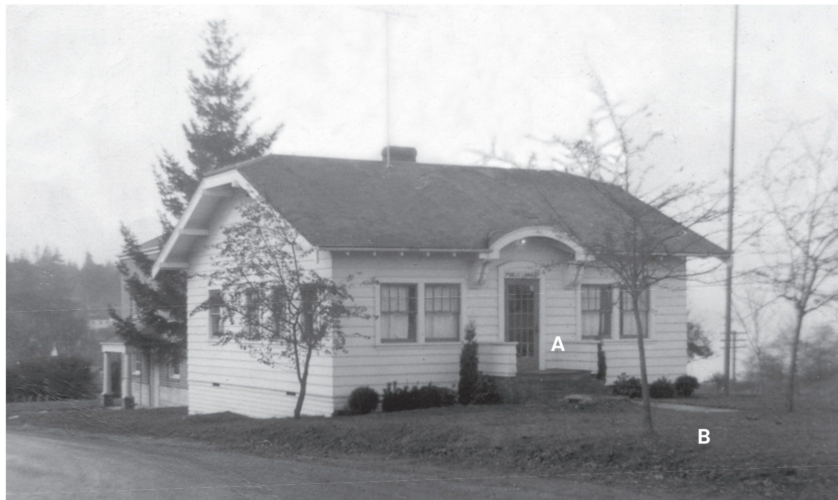
1953 Langley Public Library, view from North west.