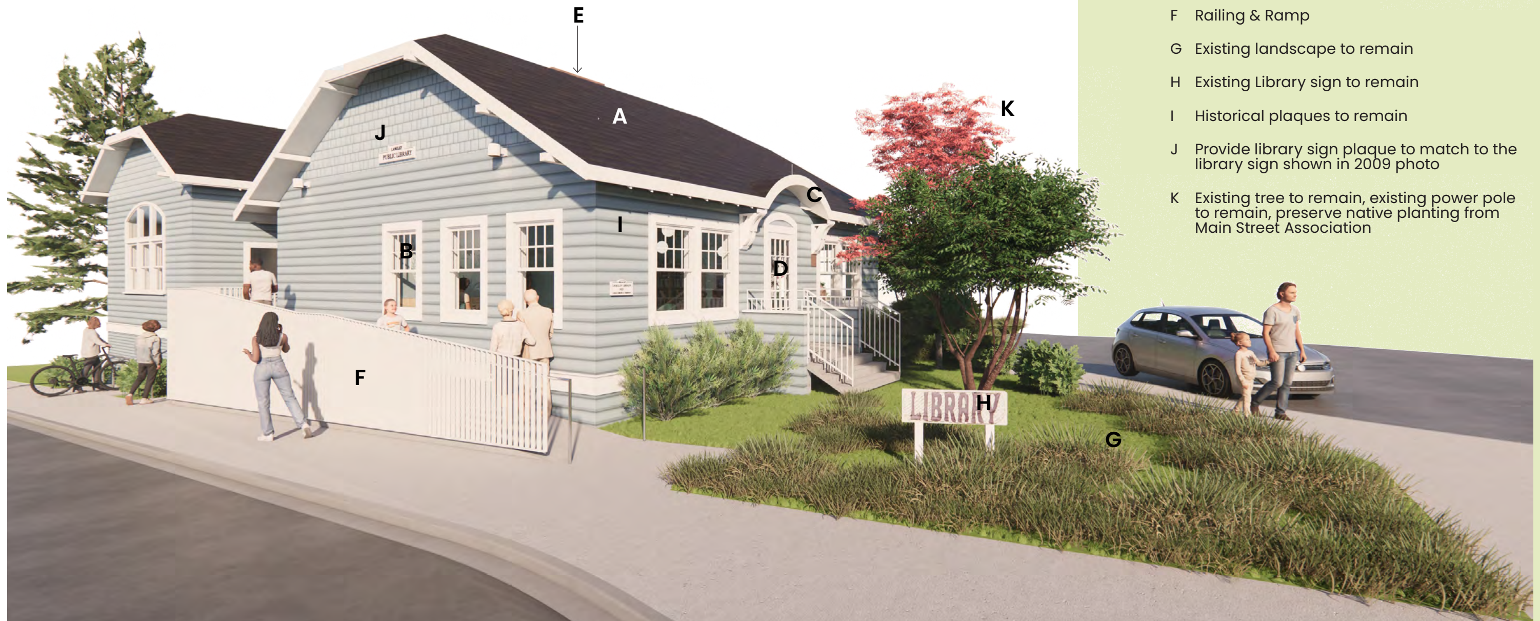
Rendering Langley Public Library, view from South East.