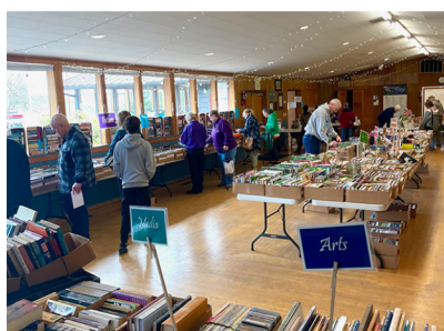
A crowd of happy shoppers at our March booksale at the Clinton Community Hall

For the March sale, we brought in $1536.50!! Membership (new and renewals): $120.00, donations: $110.50, WOW sales (pre and during sale): $471.50, regular books: $834.50.